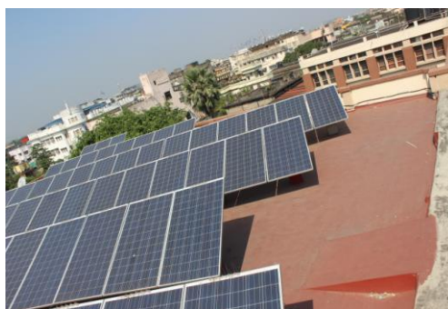
Photograph of installed rooftop solar panels